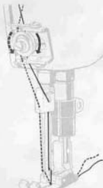
Fig. 21. Threading Needle

Turn machine pulley over toward operator until needles are at their highest point.