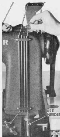
Fig. 11. Looper Threading

To thread loopers, pass threads through threading points in the order shown in Figs. 10 to 14. Dotted line indicates thread for left looper.