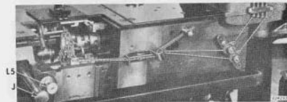
Fig. 12. Looper Threading

To thread loopers, pass threads through threading points in the order shown in Figs. 10 to 14. Dotted line indicates thread for left looper.